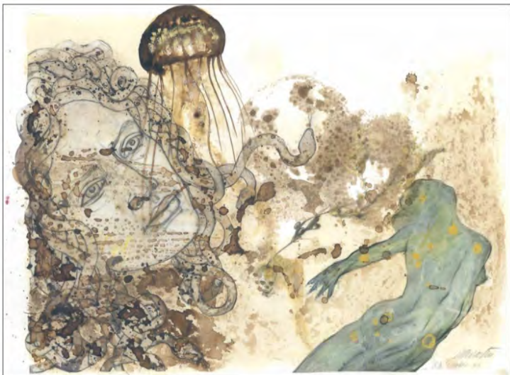
Final phase by Régis Pirastru, Strasbourg with Elli Crocker, Boston