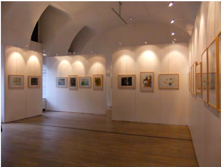
Installation in Strasbourg