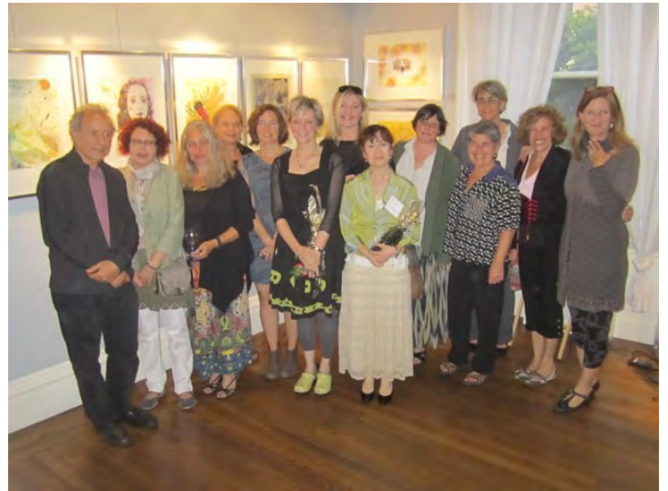
Artists at the Boston reception