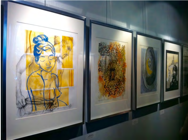
Installation in Boston

The art was created in three layers. Working in this fashion required artists to incorporate marks, materials and compositions that were foreign to their own visual vocabularies, one universal sentiment emerged: this process challenged each person to stretch artistically. Essentially, all 50 artists embraced a found object and somehow made it their own. One artist aptly said, "This project was like creating a reply to a message in a bottle."