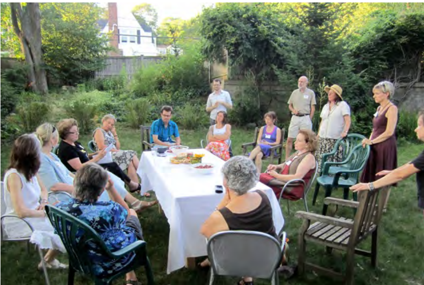
The Boston artists met and decided to randomly select a pen pal.

Fifty artists were invited to participate, half from each city and the artists were assigned "visual pen pals" from across the Atlantic.