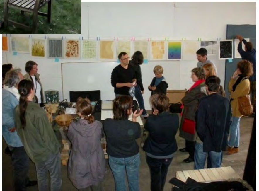
The French artists meet and decide to select their pen pal's art from a clothes line.